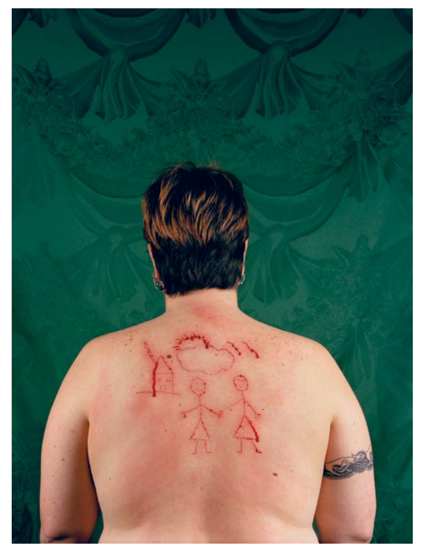
Fig. 2: Catherine Opie, Self-Portrait / Cutting , 1993, C-print, 40 x 30 inches (101.6 x 76.2 cm).

(1917). The "Modernism" section focused on the gay subcultures in cities such as New York, predominantly during World War I (1914-18), and included Marsden Hartley's Painting No. 47, Berlin (1914-15), for example, and Charles Demuth's Dancing Sailors (1917). The section "1930s and After" explored the many contributions gay and lesbian artists made to US Modernism of the 1930s, including Hartley's Eight Bells Folly: Memorial for Hart Crane (1933) and Grant Wood's painting Arnold Comes of Age (1930). The section "Consensus and Conflict" examined work produced in the fifties and early sixties, a time of social and cultural conflict, as well as one in which the US government was obsessed with "subversion" (also known as the "Lavender Scare"), prompting artists to suppress or code gay and lesbian content for fear of exposure: Robert Rauschenberg's lithograph Canto XIV (1959-60) and Jasper Johns' In Memory of My Feelings—Frank O'Hara (1961) were used as prime examples. The section "Stonewall and After" focused on work produced from the 1960s to the early 21st century, which grew out of the gay liberation movement sparked by the Stonewall Riots of 1969. Hujar's portrait of Susan Sontag (1975) and Warhol's Camouflage Self-Portrait (1986) were included in this section. In the "AIDS" section, viewers encountered works that dealt directly with the AIDS crisis in the USA (or the "gay plague," as it was also called).